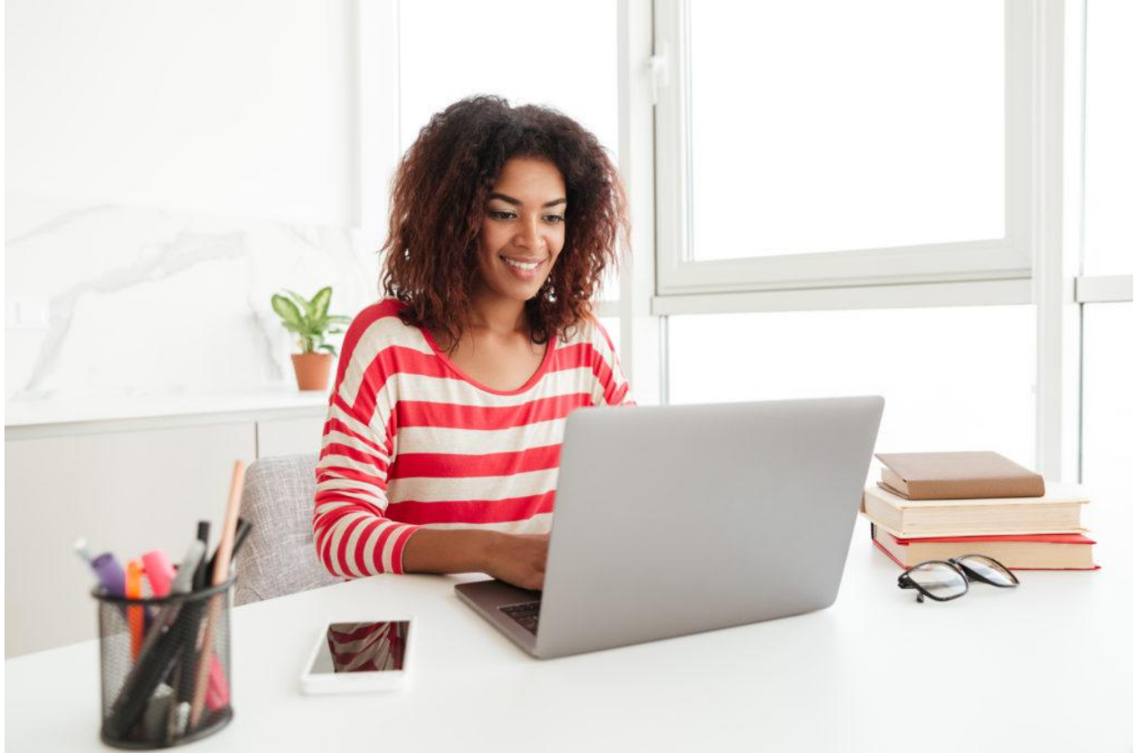
Busy smiling african woman in casual clothes working on laptop at home[/caption]

Graphics Designer: Whether you went to school or are deemed as “ self-taught ”, being a Graphics Designer is a lucrative skill that can be monetised and you have the flexibility of working with a company or as a freelancer where you work with a number of clients. This requires minimal start-up capital and all you need is literally your skills.